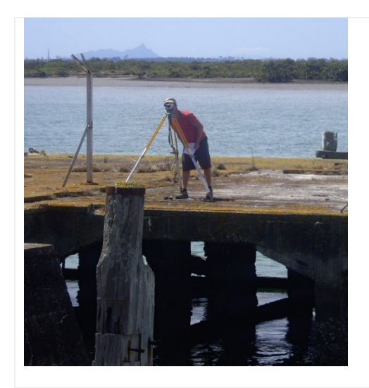
Leveling for tidal observations Limestone Island wharf – Portland channel Whangarei

All field survey operations are supervised by an International Hydrographic Organisation (IHO) Category A qualified surveyor. Other staff have relevant marine related skills or university qualifications. Successful alliances with a number of organisations have been created in the past to cater for a variety of specialist operations.