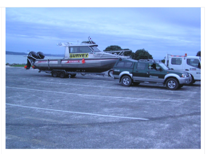
"ACHERON" Launching at dawn. Kaipara survey

POAL operates a customized 8.7m Senator survey vessel "Acheron" and has access to other vessels as required for specific projects.