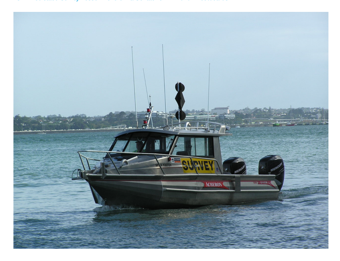
POAL Dedicated Survey vessel "Acheron" a Senator 8.7m with twin outboards

Ports of Auckland Limited (PoAL) operates a dedicated hydrographic survey division within the Marine Services department of the Port Company. This division not only carries out all surveys for POAL requirements but can be contracted to deliver a range of coastal management and surveying services.